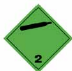
Non-flammable non-toxic gases