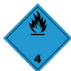
Flammable solid materials