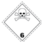
Toxic substances or preparations