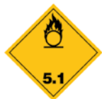
Inflammatory or oxidising substances