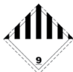
Miscellaneous dangerous substances and articles