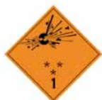
Explosive substances or preparations