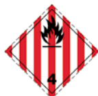
Spontaneously combustible substances